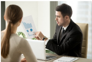
At the bank.