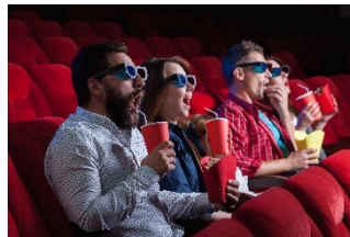
At the theatre.