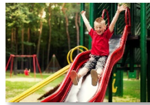
He's in a park.