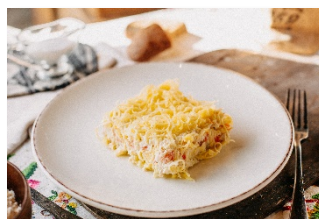
On the plate.