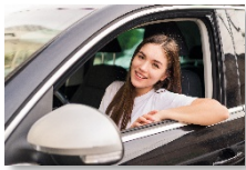
She's in a car.