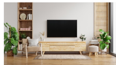
On the wall.