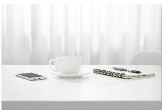
On the desk.